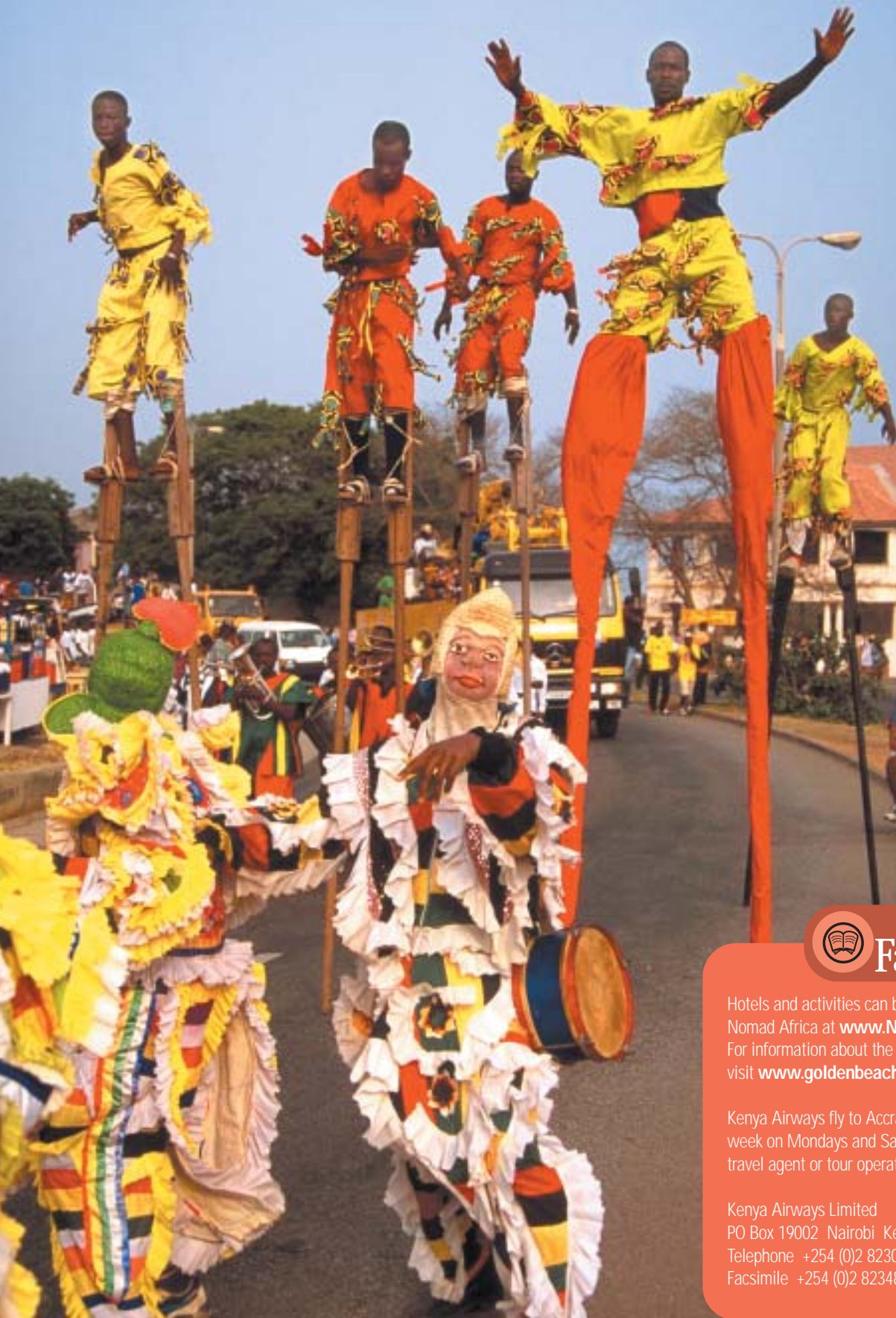
9. The annual Accra Winter Carnival takes place on New Year's Eve afternoon with a parade of colourful costumes, acrobats, marching bands, stiltwalkers and drummers.